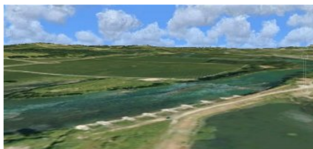
Above : the Ford at Souars on the Gave and in the left background, the hill where was the French reserve...

It's now easy to place correctly the different terrain elements and troops on the battle field. With GoogleEarth , you can even explore the battlefield as in live, to verify some points of relief, for example: