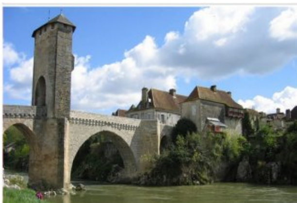
The Old Bridge at Orthez

For example, the information on the historical background has been found mainly on Wikipedia and allows an historical scenario.